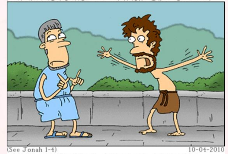
JONAH ATTEMPTS TO SHARE HIS TALE WITH DOUBTING THOMAS